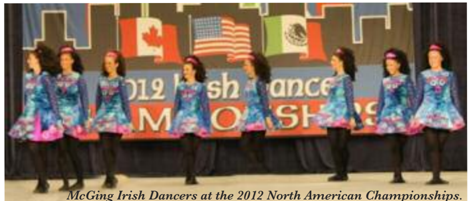
McGing Irish Dancers at the 2012 North American Championships.